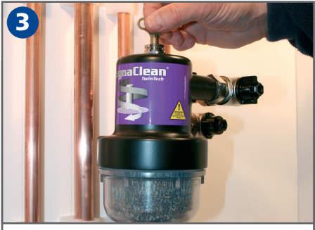
Replace the Pro-Fill air vent. Allow the system to circulate for 30 seconds. Open the Pro-Fill screw two turns and back-flush until clear.