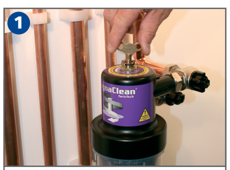
With a standard radiator key, remove the Pro-Fill air vent. The built-in, one-way valve will prevent water from escaping. Attach the chemical adapter and feed in the chemical.