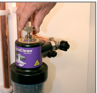
Open the isolation valves to the marked ON position and vent through the Pro-Fill air vent. When venting, protect the surface below the canister with the servicing tray provided to capture any drops of water. Run the central heating system while checking for leaks. Repeat steps 1 - 6 if required. Ensure the filter is thoroughly clean before leaving the premises.