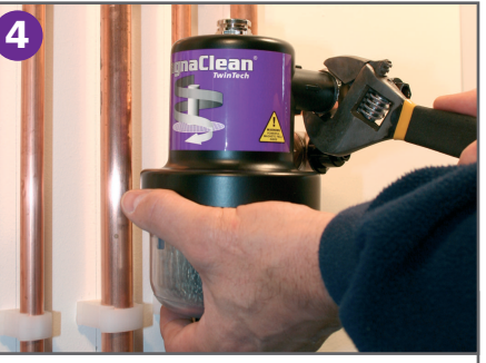
Loosely secure the MagnaClean TwinTech canister to the valves, following the flow direction indicated on the canister. Tighten the compression fittings, being careful not to over tighten.

Prepare the pipe and fittings accordingly. Lubricate the olives and assemble the valves on the pipe. Hand tighten.