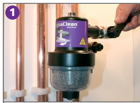
Important - Before commencing any servicing work turn off the electrical supply to the boiler. Turn both isolation valves to the marked OFF position. Loosen the air vent to release internal pressure. When venting, protect the surface below the canister with the servicing tray provided to capture any drops of water.