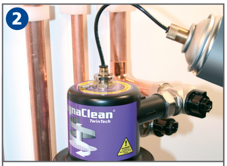
Wait five seconds before removing the adaptor. The Pro-Fill air vent will accept all market-leading chemicals in either liquid or concentrate form.