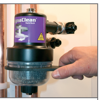
Re-attach the clear base to the top section of MagnaClean TwinTech and tighten until sealed. Do not over tighten.